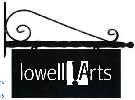
HANGING SIGN. 36" WIDE X 16" HIGH, 3 SQUARE FEET.

DONOR PLAQUE WHITE ACRYLIC WITH RAISED WHITE LETTERS. BRASS PLAQUE 8" WIDE X 2" HIGH OPTION A OPTION B 8" WIDE X 3.5" HIGH