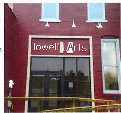
REAR SIGN. OPTION A