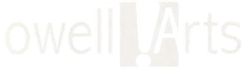
REAR SIGN. OPTION A SAME GRAY AS DOOR TRIM